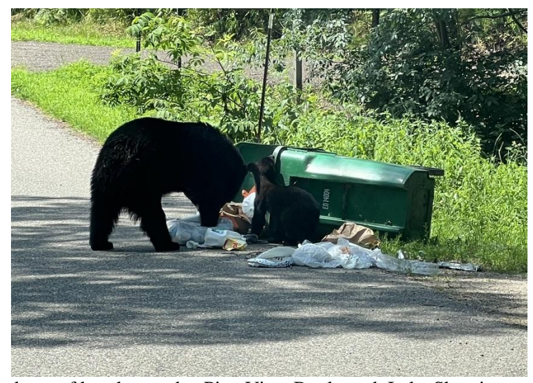
Mama bear and one of her three cubs, Pine View Boulevard, Lake Shamineau, Summer 2024