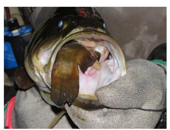
Bass with a panfish in its mouth