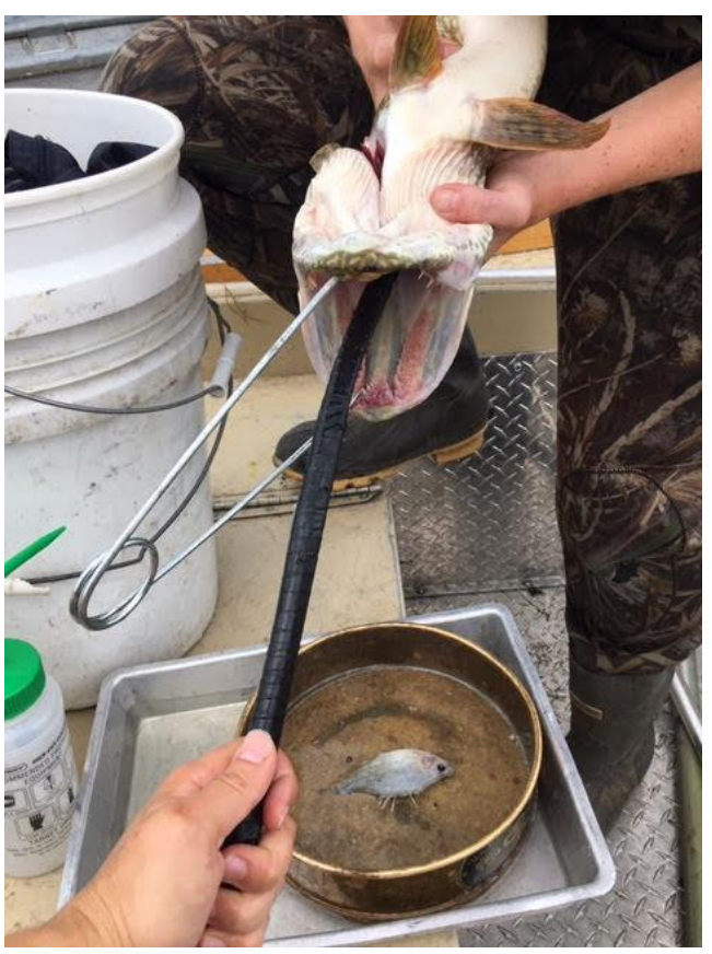
Large Northern Pike getting stomach contents flushed