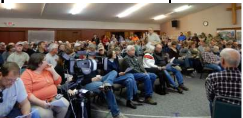
Nearly 200 people attended the LSLID public hearing April 21 to review the engineering feasibility study and the 429 process about the proposed project designed to make improvements to maintain a more consistent water level and to express their comments.

The Feasibility Report is complete and has been accepted by the LSLID Board after several meetings with the public, Shamineau riparian property owners, The Minnesota Department of Natural Resources (DNR), Morrison County commissioners, the Morrison