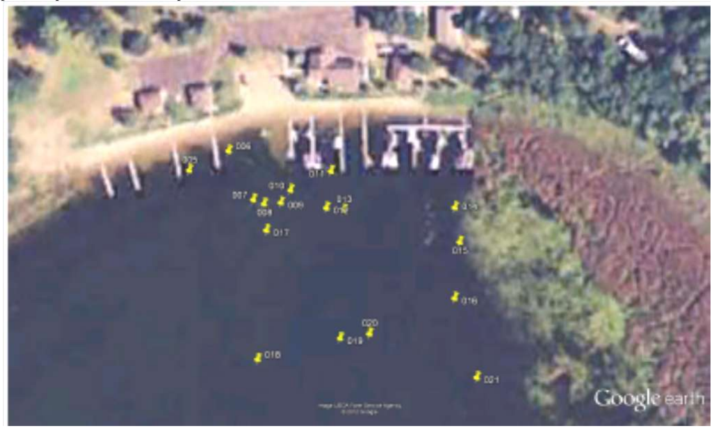
Invasive Eurasian watermilfoil locations identified in northwest bay.

The lake will be designated as an infested water later this month. That means restrictions on bait harvest and transport of water from the lake will be in effect.