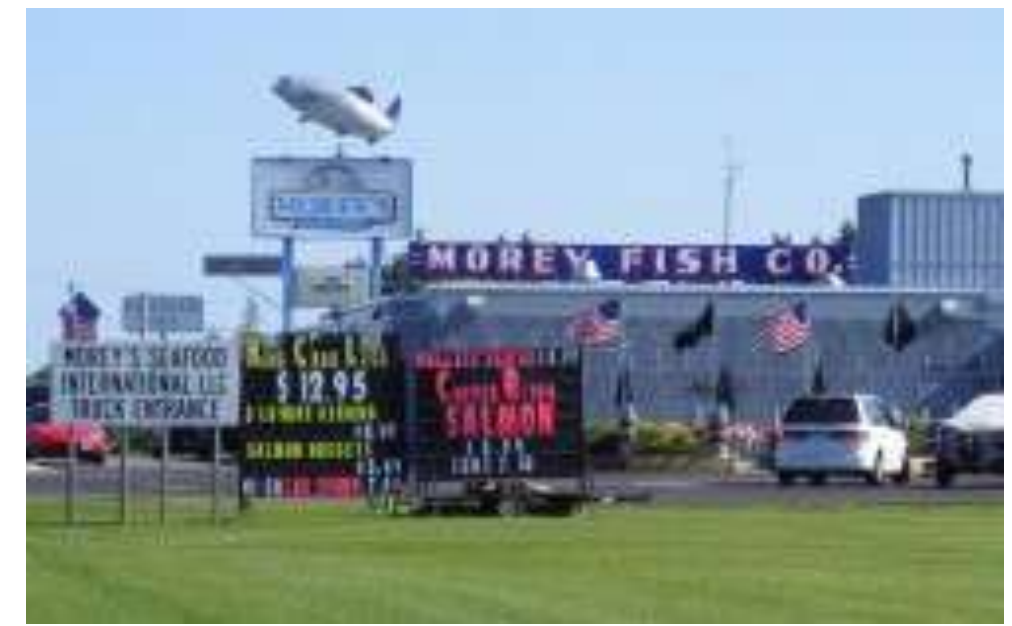
Correction: In an article about gull droppings in the Spring 2012 issue of the Lake Shamineau Newsletter, Morey's Seafood in Motley was incorrectly identified as a source of red dye from imitation crab meat. Morey's is known for their walleye filets, lake fish, smoked salmon and other seafood. Our apologies go to Morey's and their loyal customers.

As I close, I extend an offer to all of you to get involved in the work of the Association. Feel free to contact a Board member if you have any suggestions or want to help out in any way. Enjoy the last few days of summer!