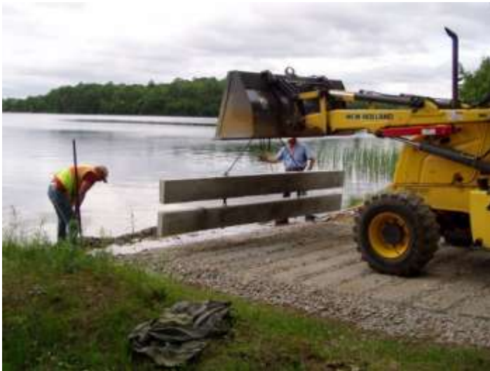
Adding more planks two at a time.