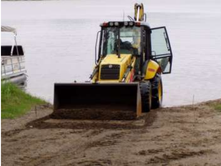
Grading before rock goes in.