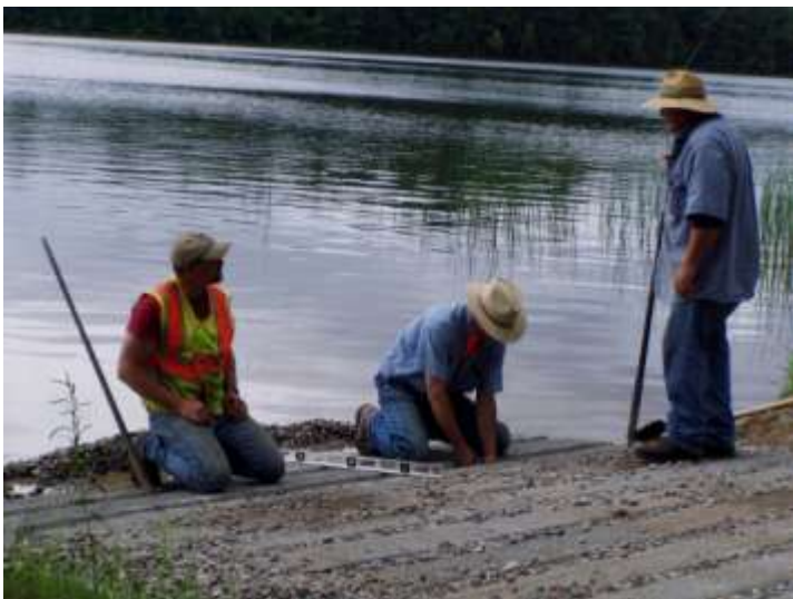
Leveling and filling spaces with rock.

Improvements to the Scandia Valley Township boat landing on the east side of Lake Shamineau have been completed. The landing now includes a class five and gravel base with horizontal concrete planks that provide a firm surface for vehicles and trailers launching boats. There will be signage placed at the launch noting the collaborative effort.